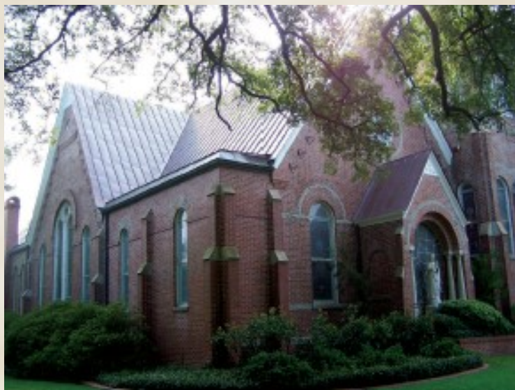
A Church of the Diocese of Charleston

Office Hours: Monday – Thursday 9:00 AM to 5:00 PM Friday 9:00 AM to 1:00 PM Phone: 843-546-7416