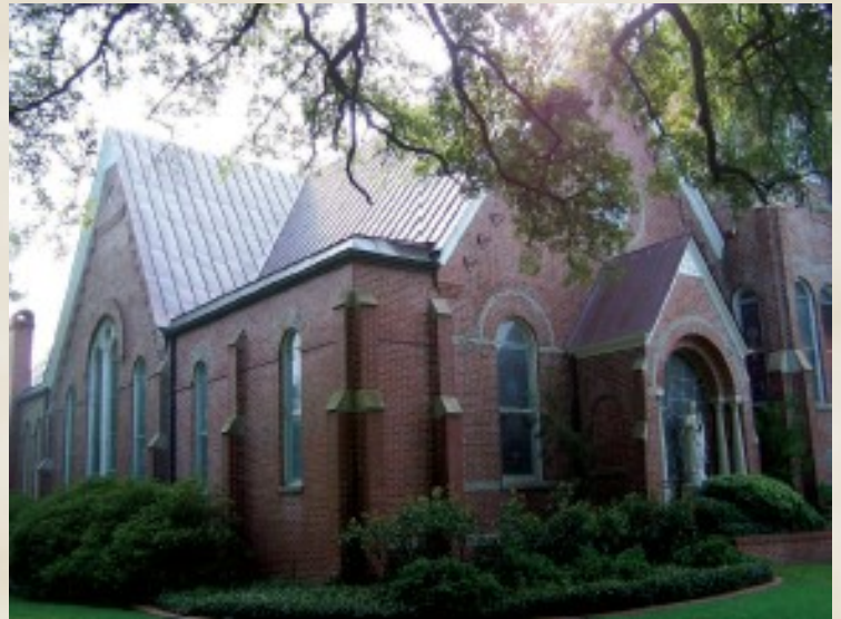
A Church of the Diocese of Charleston

Office Hours: Monday – Thursday 9:00 AM to 5:00 PM Friday 9:00 AM to 1:00 PM Phone: 843-546-7416