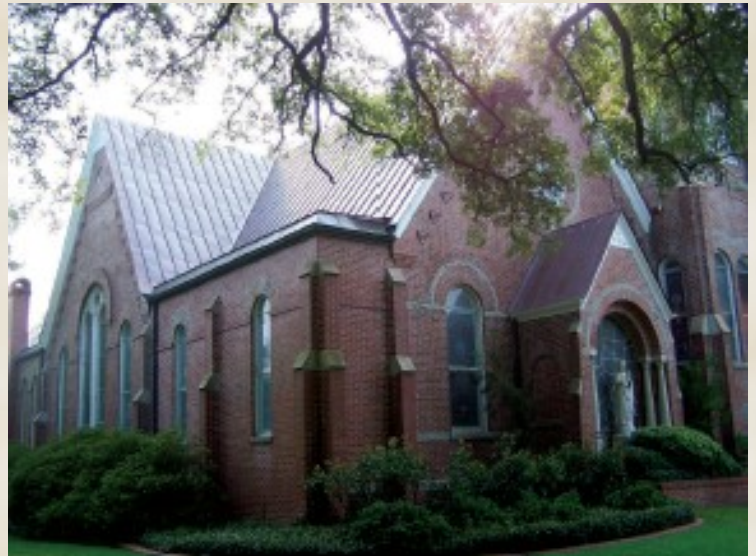
A Church of the Diocese of Charleston

Office Hours: Monday – Thursday 9:00 AM to 5:00 PM Friday 9:00 AM to 1:00 PM Phone: 843-546-7416 Fax: 843-546-7003