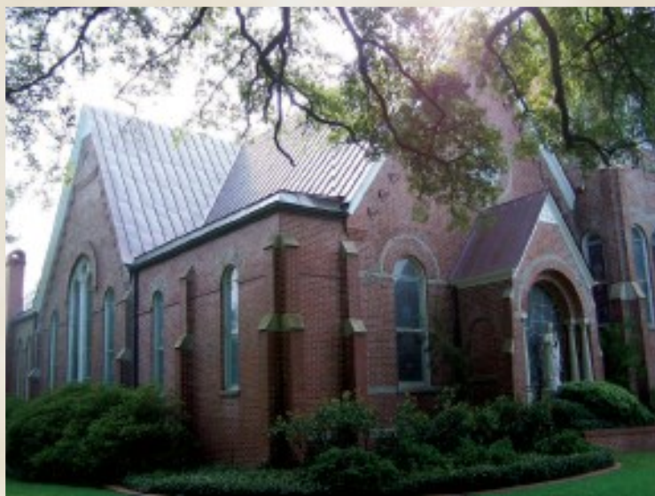
A Church of the Diocese of Charleston

Office Hours: Monday – Thursday 9:00 AM to 5:00 PM Friday 9:00 AM to 1:00 PM Phone: 843-546-7416