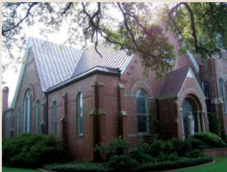
A Church of the Diocese of Charleston

Office Hours: Monday – Thursday 9:00 AM to 5:00 PM Friday 9:00 AM to 1:00 PM Phone: 843-546-7416 Fax: 843-546-7003